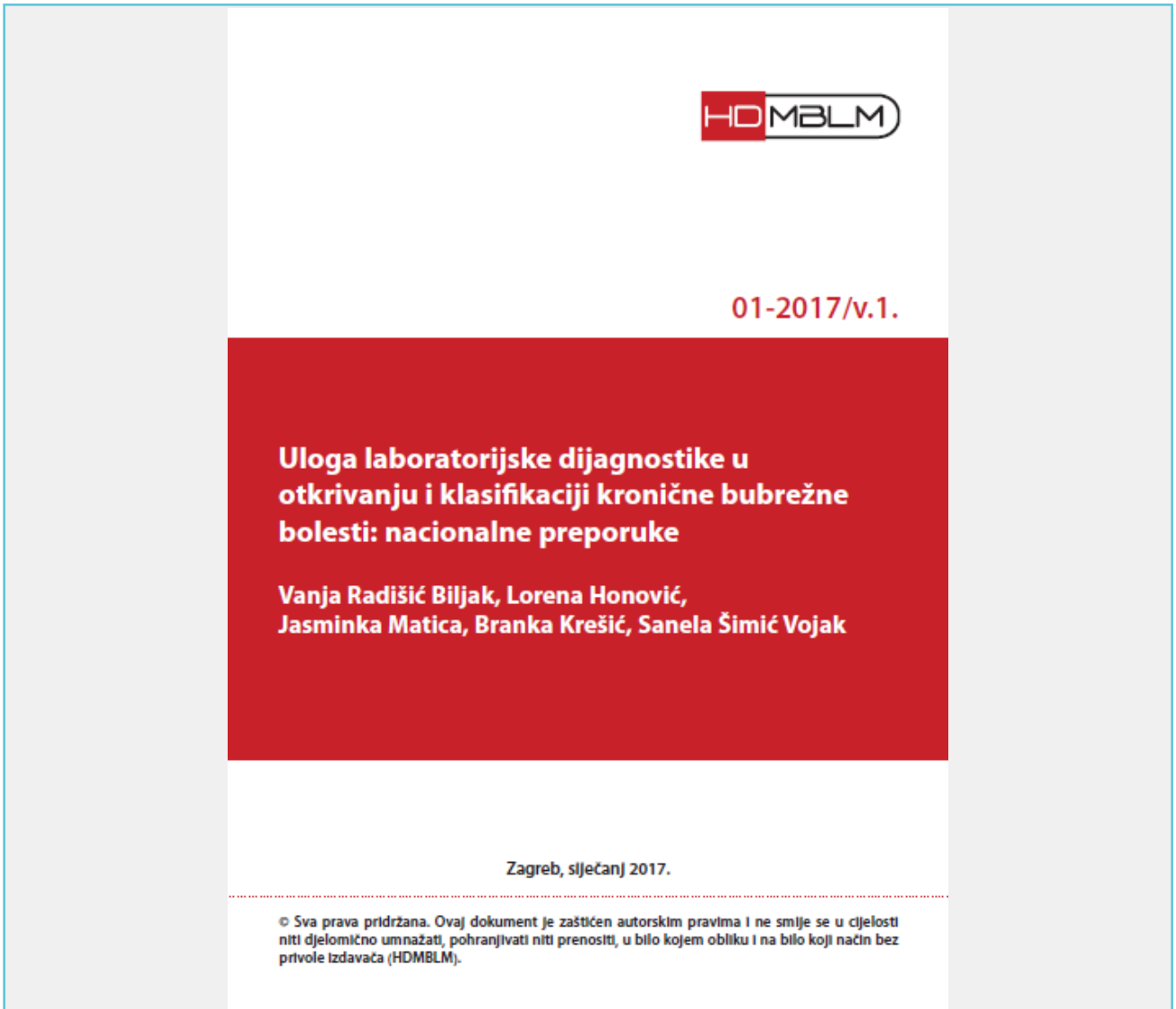
Figure 3 The main page of a Croatian national recommendations for laboratory diagnostics of chronic kidney disease (booklet)

The national recommendations are mainly based on the KDIGO 2012 guidelines, however, novel literature findings are also incorporated. Considering the results obtained via conducted survey, our main goal was to provide recommendations that can be easily applied in every medical biochemistry laboratory in Croatia. We, as a WG and authors of recommendations, decided to start at the basic laboratory tests used in laboratory diagnostics of CKD: creatinine, eGFR, urine albumin-to-creatinine ratio (ACR)